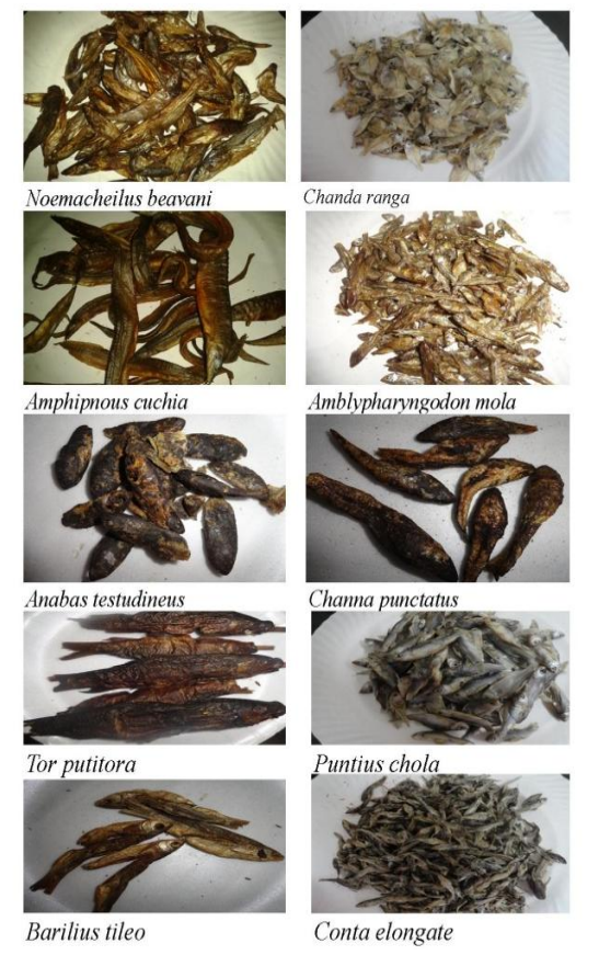
Fig. 2. Ten selected dried fish samples